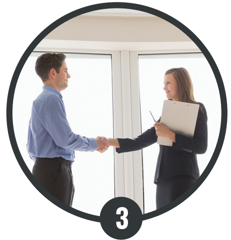
3 KNOW YOUR PROSPECT

“ We did a series of focus groups with our members last summer to find out what they thought of Mainstreet and where they saw the value of membership. In each group, participants said FOREWARN was their most useful and appreciated member benefit. ”