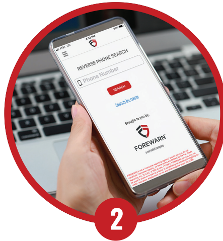
2 CHECK THE FOREWARN APP