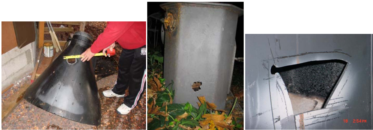
Above are example images of older stoves which have been rendered inoperable by cutting a whole in the firebox.