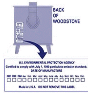
Permanent Wood Stove Label (typically affixed to the back of a stove)