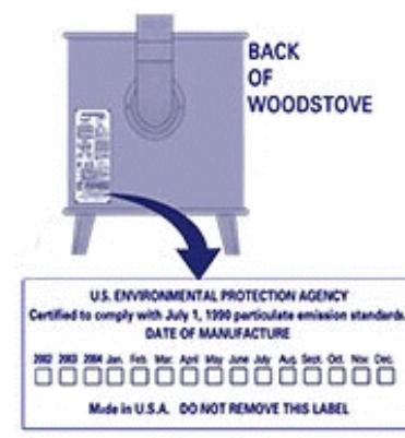
Permanent Wood Stove Label affixed to a stove